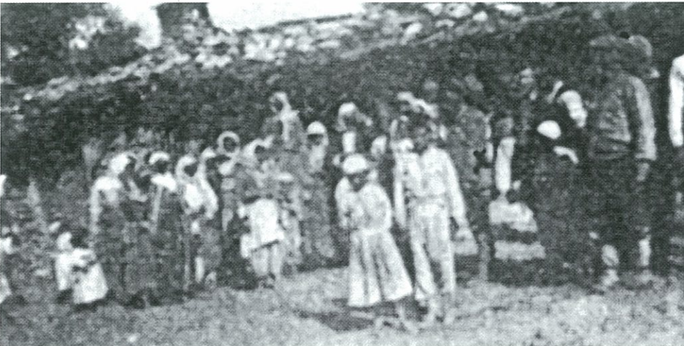
Fig. 3 An inspection for malaria cases at the village of Macar, published in Türk Akdeniz Dergisi in 1938