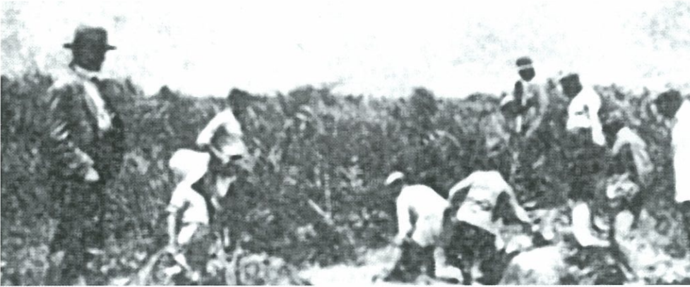
Fig. 2 A photo of canal digging, part of the campaign against malaria with the draining of marshes and swamps, published in Türk Akdeniz Dergisi in 1938.