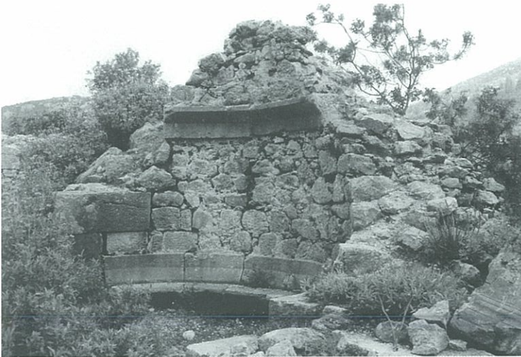
Fig. 4 The Severan exedra.