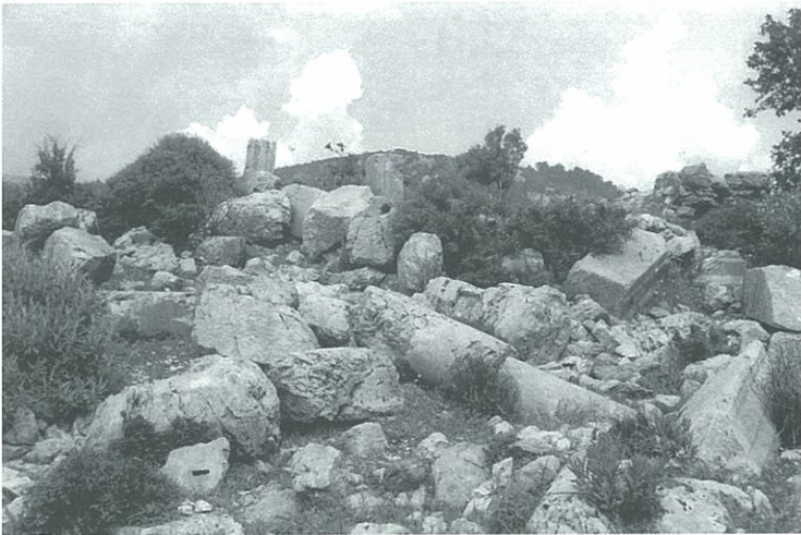
Fig. 3 The temple in the agora.