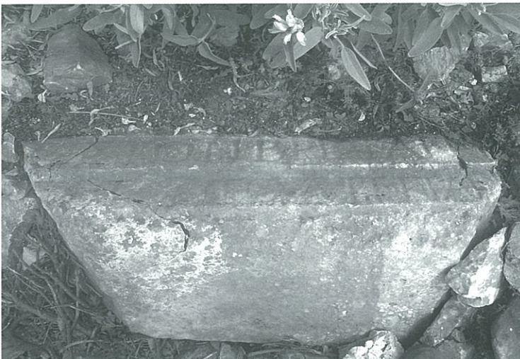
Fig. 5 The inscribed architrave fragment.