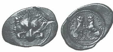
Fig. 12 Tlos. Stater. 8.50 g. Fritz Rudolf Künker Münzenhandlung, Auction 94, Sept. 27 th , 2004, nr. 1281.