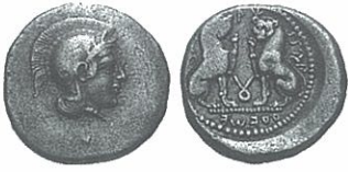
Fig. 8 Wekhssere II. 1/2 Stater. 4.19 g. Classical Numismatic Group, 61, Sept. 25 th , 2002, nr. 761.