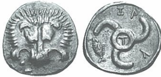
Fig. 17 Zagaba. Stater. 9.87 g. Classical Numismatic Group, Triton VIII, Jan. 11 th , 2005, nr. 499.