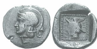
Fig. 6b Hêtruma. 1/2 Stater. 4.08 g. Dr. Busso Peus Nachfolger, Auction 378-379, nr. 273.