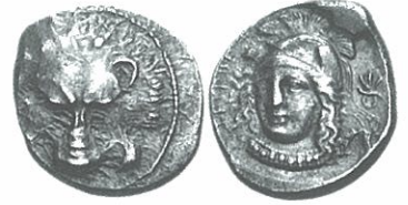
Fig. 16 Zagaba. 1/3 Stater. 3.03 g. Classical Numismatic Group, 73, Sept. 13 th , 2006, nr. 383.