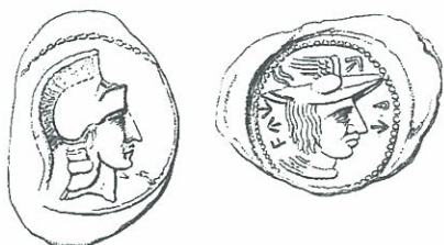
Fig. 2 Wekhssere II. Stater. 8.36 g. Image: Kat. Wien, 173, nr. 70. Dwg: Fellows 1855, Pl. XVIII, 3.