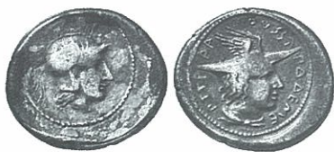
Fig. 1 Wekhssere II. Stater. 8.00 g. UBS Gold & Numismatics, Auction 59, Jan. 27 th , 2004, nr. 5790.