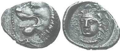
Fig. 14 Wekhssere II. 1/3 Stater. 2.79 g. Dr. Busso Peus Nachfolger, Auction 372, Oct. 30 th , 2002, nr. 368.