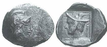
Fig. 7 Cadyanda. Stater. 8.04 g. Dr. Busso Peus Nachfolger, Auction 378-379, nr. 276.