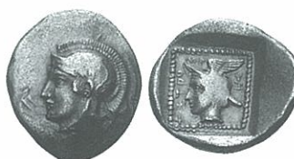
Fig. 6a Hêtruma. 1/2 Stater. 4.00 g. Auktionshaus H. D. Rauch GmbH, Auction 73, May 17 th , 2004, nr. 311