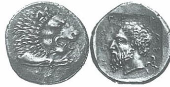
Fig. 18 Mithrapata. Stater. 9.82 g. LHS Numismatik AG, Auction 95, Oct. 25 th , 2005, nr. 692.