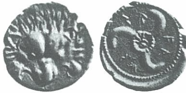
Fig. 15 Wekhssere II. 1/3 Stater. 3.19 g. SNG Lykien, Taf. 138, 4201.