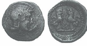
Fig. 9 Wekhssere II. 1/6 Stater. 1.35 g. Dr. Busso Peus Nachfolger, Auction 368, April 25 th , 2001, nr. 229.