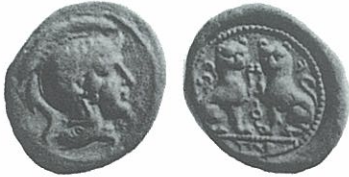
Fig. 11 Tlos. Stater. 8.04 g. SNG Lykien, Taf. 138, nr. 4185.