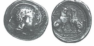
Fig. 10 Wekhssere II? ( ddentmi? ), Stater, 8.21 g. Gorny & Mosch Giessener Münzhandlung, Auction 122, March 10 th , 2003, nr. 1461.