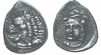
Fig. 13 Wekhssere II. Stater. 9.89 g. Leu Numismatik AG, Auction 81, May 16 th , 2001, nr. 311; Olçay – Mørkholm 1971, 2, nr. 1.