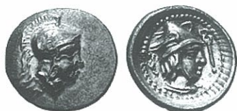
Fig. 5 Tlos. 1/6 Stater. 1.11 g. Classical Numismatic Group, 60, May 22 nd , 2002, nr. 838.