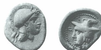
Fig. 3b Patara. Stater. 7.71 g. Image: BMC Lycia, Pl. VII, 5. Dwg: Fellows 1855, Pl. XVIII, 2.