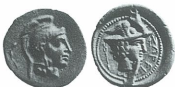
Fig. 4 Tlos. Stater. 8.15 g. SNG Lykien, Taf. 138, nr. 4194.