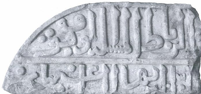
Fig. 2 The building inscription of the Derebucak Hanı.